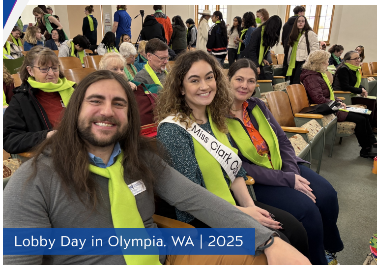
Lobby Day in Olympia, WA | 2025

NAMI SW WA is a 501(c)(3) organization that depends on generous donations from community organizations and businesses like yours to support the essential work we do. We strive to use every dollar received for direct service to individuals, families and the greater community.