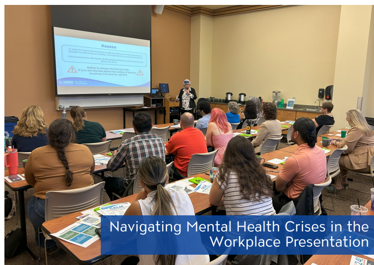
Navigating Mental Health Crises in the Workplace Presentation